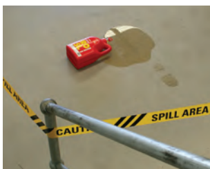
"CAUTION /// SPILL AREA" tape is ideal to isolate the spill site and keep personnel safe.