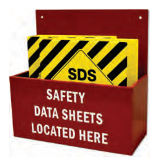
*Binders not included