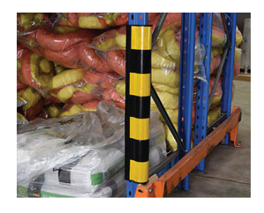
Rubber wall protector Class 1 retroreflective | 800mm high Code: TRS-RWP800

Protect your personnel and equipment on site